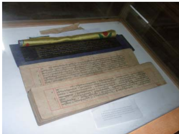
Photo 3-2-3 Example of stored Buddhist scriptures.