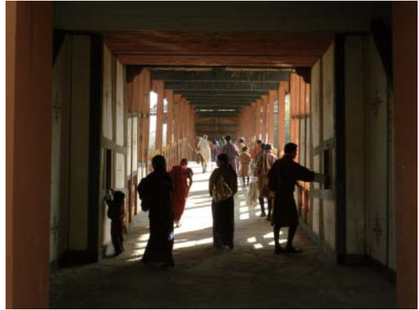
Photo 2-5-1-3 Interior of the bridge.