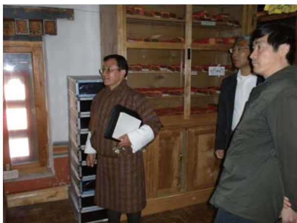
Facility introduction by the curator of the national library and public records building.