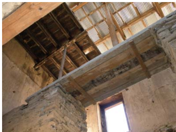
Photo 2-1-4 Interior of the gate.