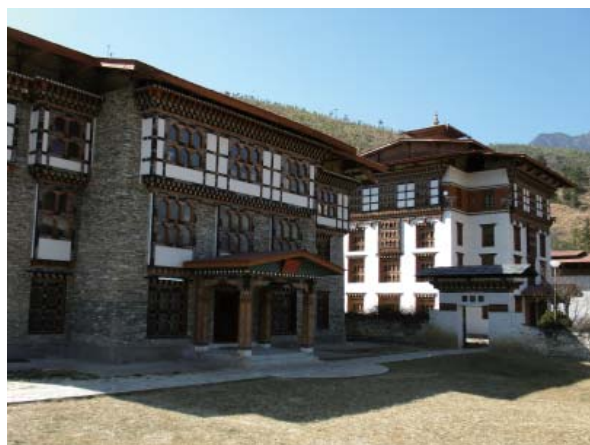
Photo 3-2-1 National library and Archives office.