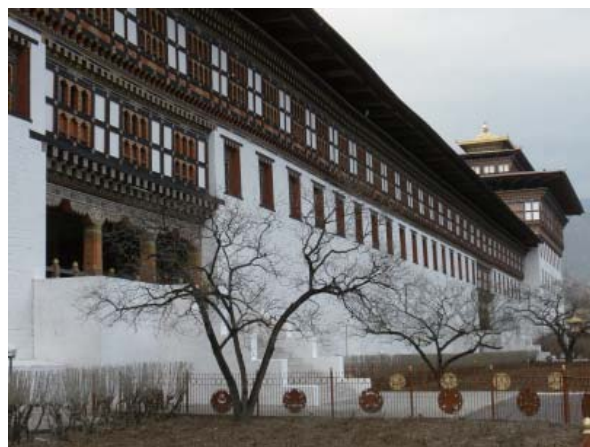
Photo 2-6-2 The entrance.