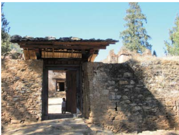
Photo 2-1-3 Outermost gate.