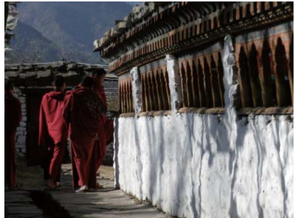
Photo 1-2-3 Buddhist monks walking clockwise around temple periphery.