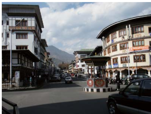
Photo 3-1-2 Intersection at center of Thimphu city.