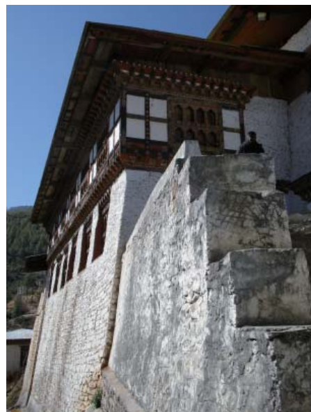
Photo 1-3-2 East face exterior.