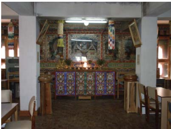
Photo 3-2-2 Alter in the main library.