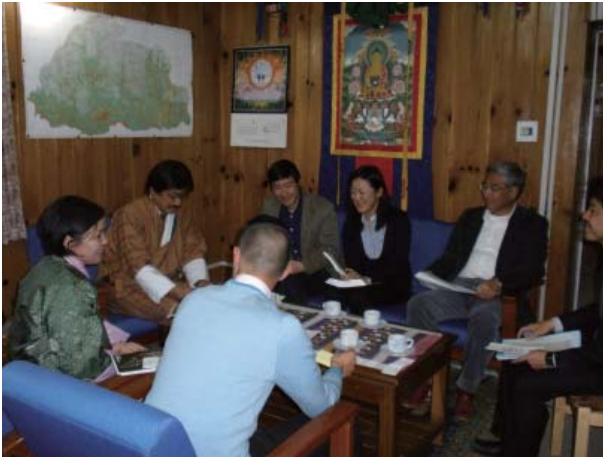
Visit to the JICA Bhutan office.