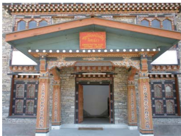
Photo 3-3-2 The entrance.