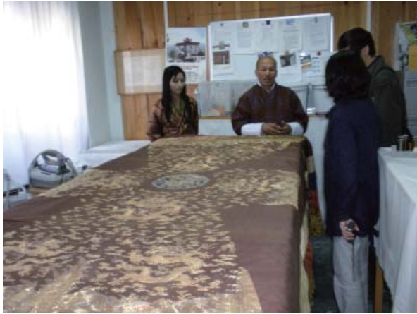
Photo 3-3-3 Conservation studio.