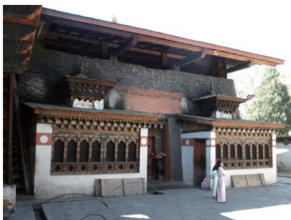
Photo 1-3-6 Shrine facing main hall.