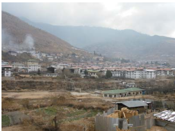
Photo 3-1-5 South suburb of the city under development.