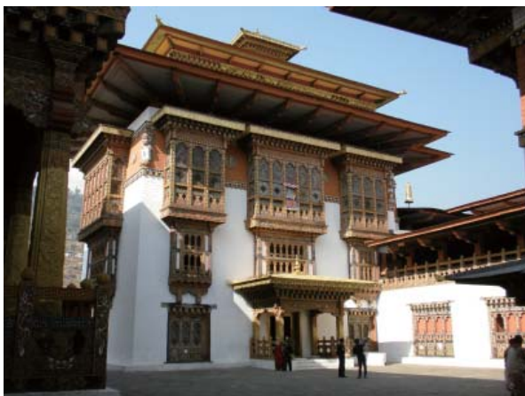
Photo 2-5-4 Reconstructed Machen Lhakhang.