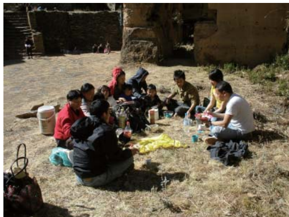
Photo 2-1-6 People picnicking in the ruins.