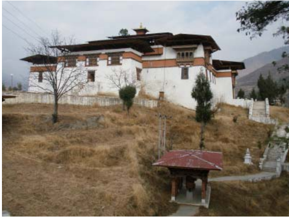
Photo 2-2-1 Simtokha Dzong, view from south.