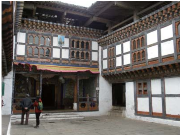
Photo 2-4-4 Third courtyard.