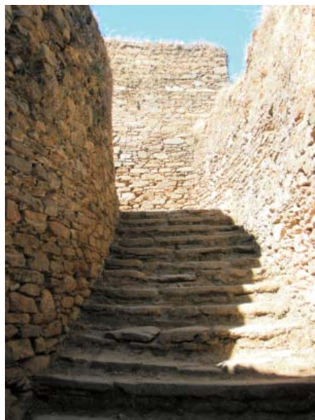
Photo 2-1-2 Steps in front of the citadel gate.