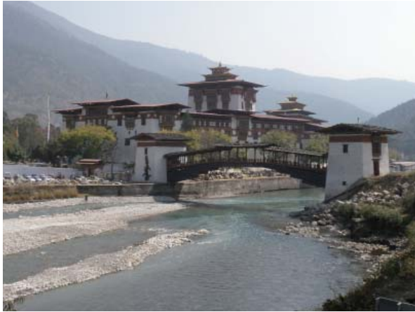
Photo 2-5-1-2 Recently reconstructed covered bridge.