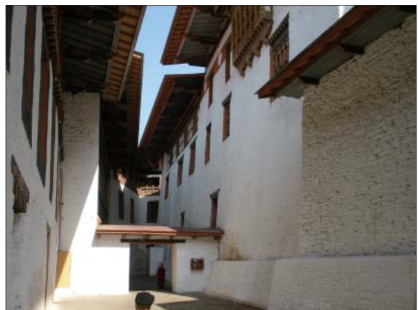
Photo 2-5-5 Monk's living quarters in the west side.