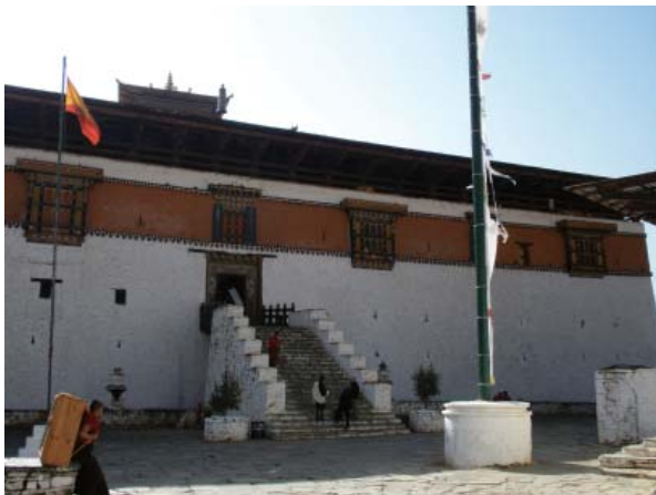
Photo 2-3-3 Main entrance of the east face of Dzong.