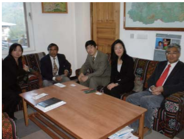
Interview with the UN Regional Coordinator.