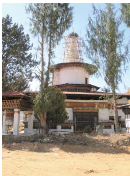
Photo 1-5 Duntze Lhakhang.