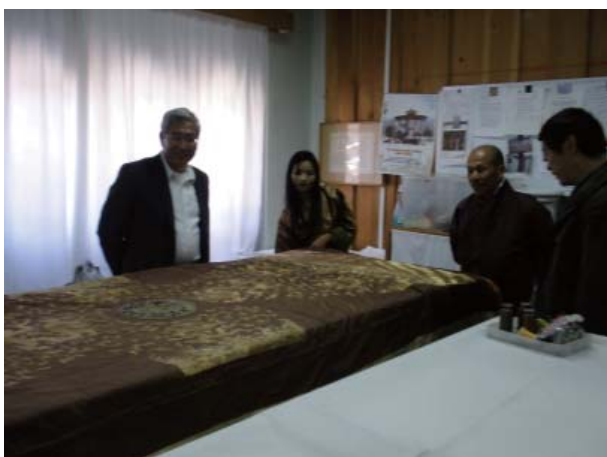
Facility introduction by the director of the textile museum.