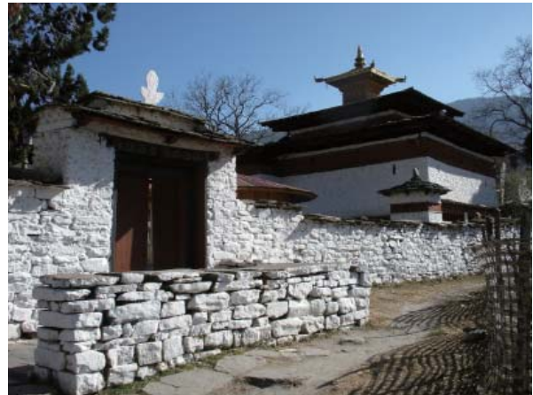
Photo 1-2-1 Kyichu Lhakhang gate and main hall.