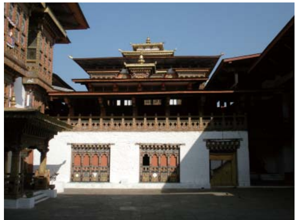
Photo 2-5-3 South facade of protective divinity's shrine.