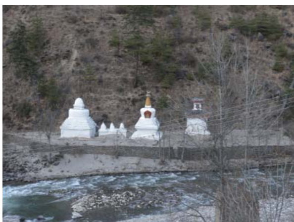
Photo 1-4 Chorten at Chuzomu.