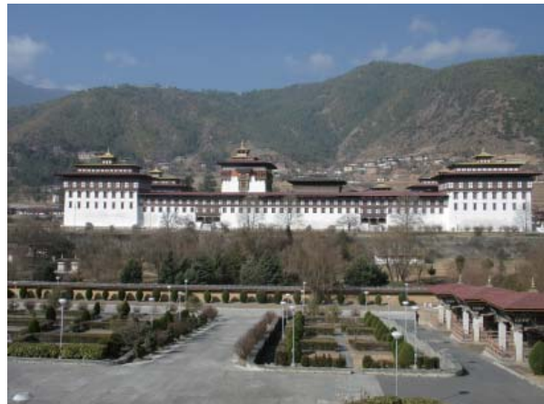
Photo 2-6-1 East face of Trashichho Dzong.