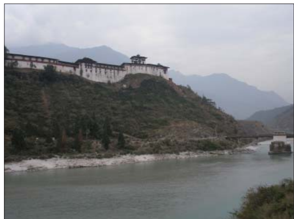
Photo 2-4-1 Overall view of Wangdi Phodrang Dzong (from northwest).