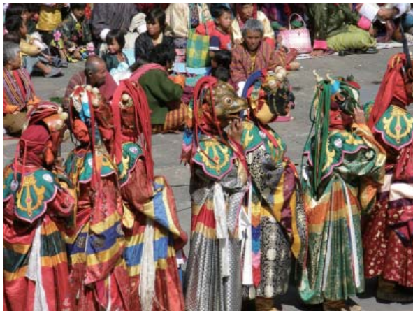
Photo 2-5-8 Same as Photo 2-5-6.