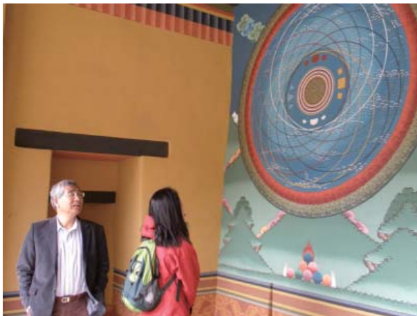
Visit at the Simtokha Dzong.