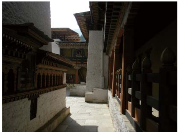
Photo 2-2-4 A passage in the courtyard.