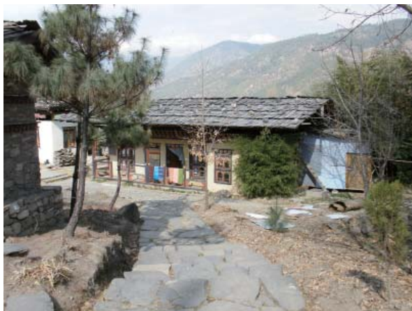
Photo 3-4-4 Office building.