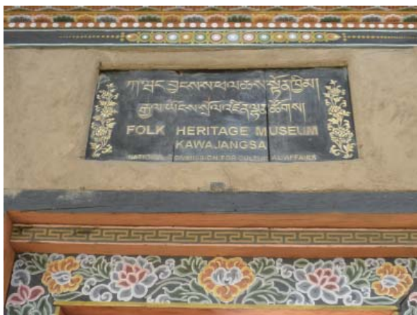
Photo 3-4-1 Sign above gate to folk heritage museum.