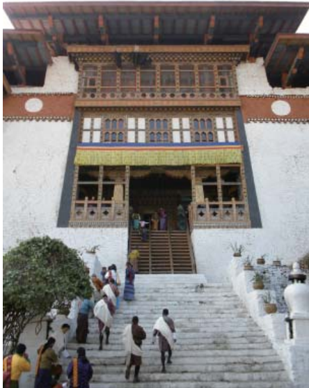
Photo 2-5-2 Looking up at Dzong entrance on the north side.