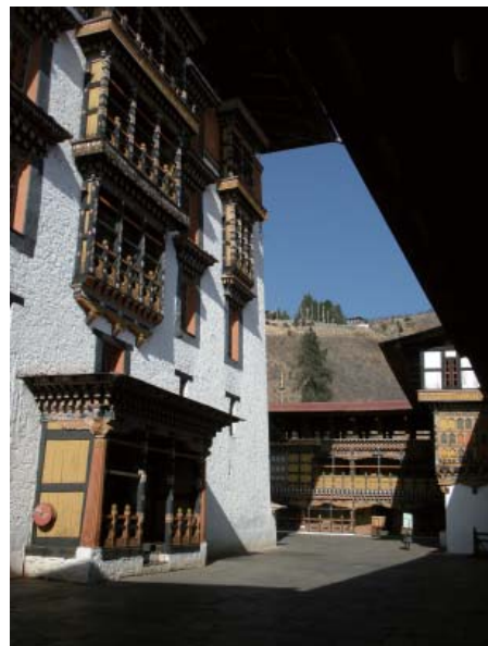
Photo 2-3-4 Courtyard and Utse.