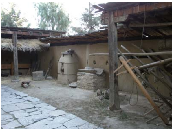
Photo 3-4-3 Frontyard.