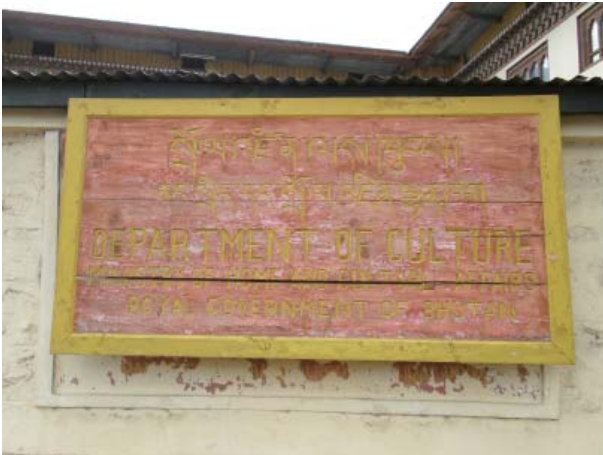
Sign of the Dpartment of Culture.