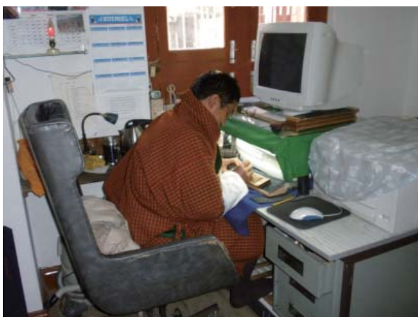
Photo 3-2-4 Buddhist scriptures block engraving work.