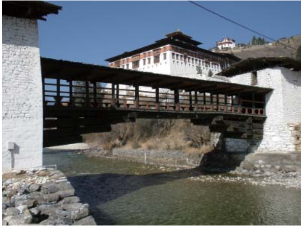
Photo 2-3-1 Covered bridge at the entrance to Paro Dzong.