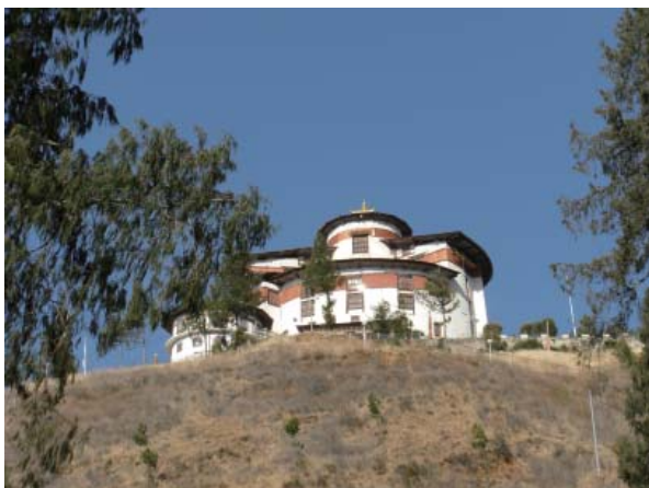
Photo 2-3-5 Looking up at Ta Dzong from Paro Dzong.