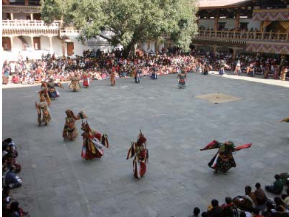
Photo 2-5-6 Mask dance (Cham) performed in the Punakha Dzong courtyard.