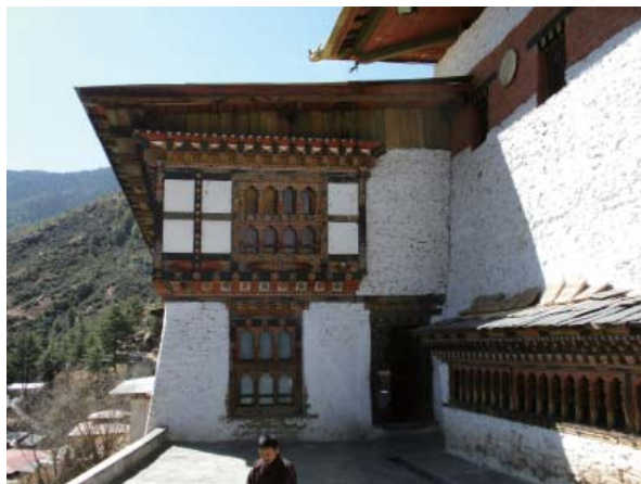
Photo 1-3-4 Main hall east face.