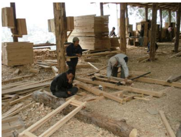
Photo 2-4-6 Carpentry workshop for restoration of the Dzong.