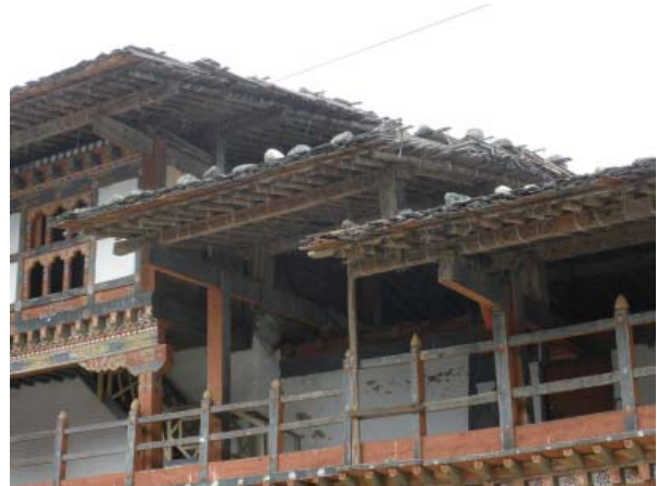
Photo 2-4-5 Single roof with stones on top.