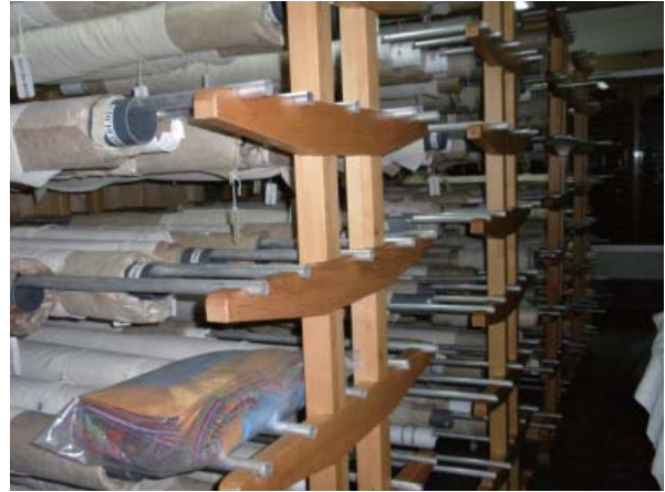
Photo 3-3-4 Storage.