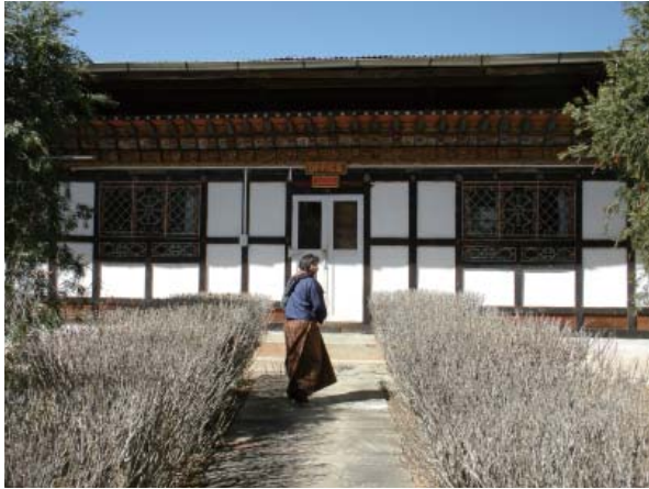
Photo 3-5-5 Old office building.