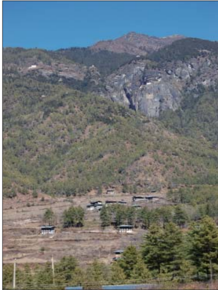
Photo 1-1-1 A distant view of the Taktshang monastery.