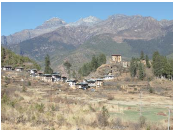
Photo 2-1-1 Overall view of Drukgyal Dzong.