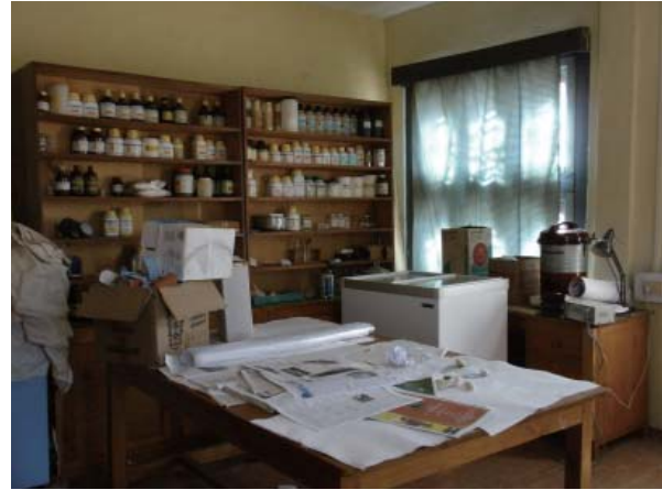
Photo 3-5-6 Interior of the conservation laboratory.