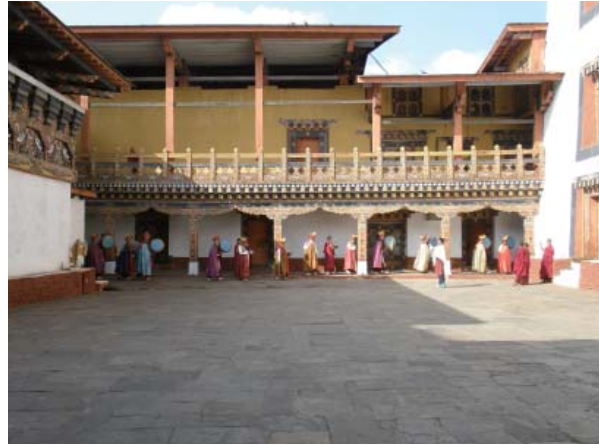
Photo 2-5-7 Cham in the courtyard to the south of Utse.