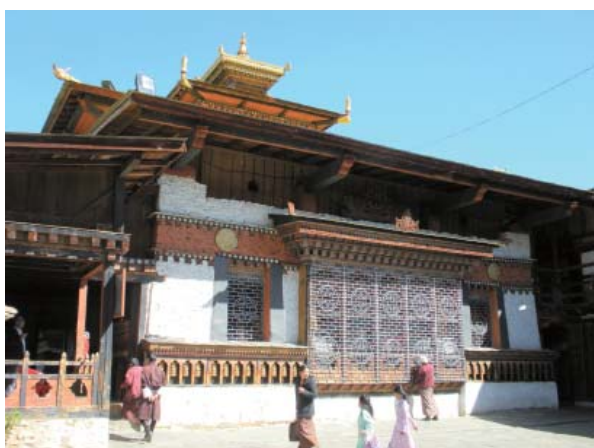
Photo 1-3-5 Front facade of main hall.