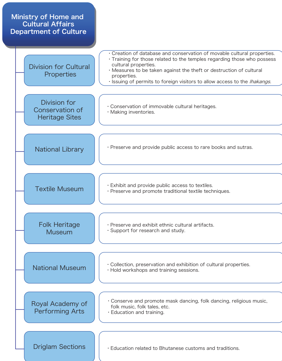
Fig. Organization Chart for the Bhutanese Royal Ministry of Home and Cultural Affairs, Department of Culture.