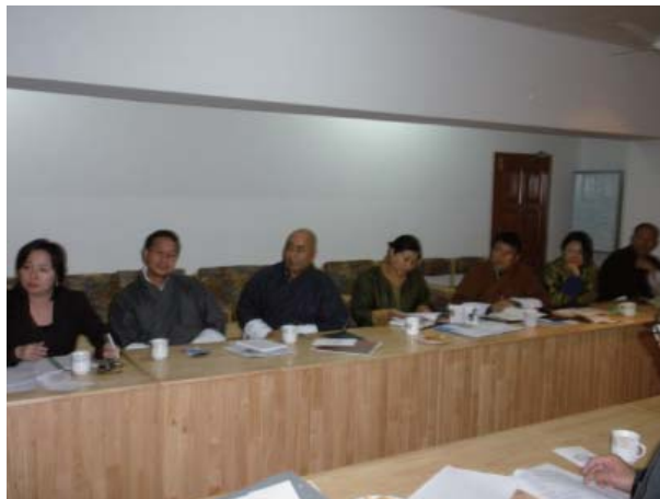
Same as above.