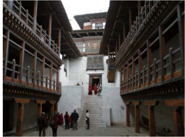
Photo 2-4-3 Second courtyard and Utse.