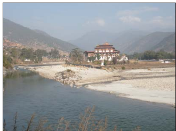
Photo 2-5-1-1 Confluence of two rivers and Punakha Dzong.