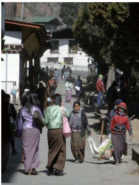
Photo 3-1-1 A street in Thimphu.