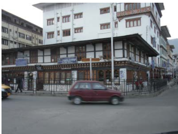
Photo 3-1-3 An old townhouse at the corner.