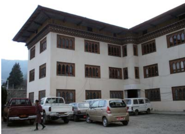
Department of Culture building exterior.