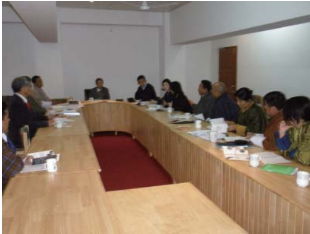
International Ministry of Home and Cultural Affairs Office, Ritsumeikan-UNESCO Mission, intangible heritage assets department, state of the joint meeting of the consortium.