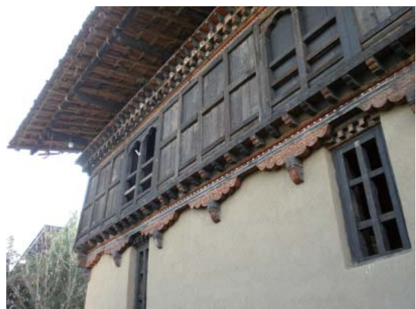
Photo 3-4-2 Looking up at the main building.