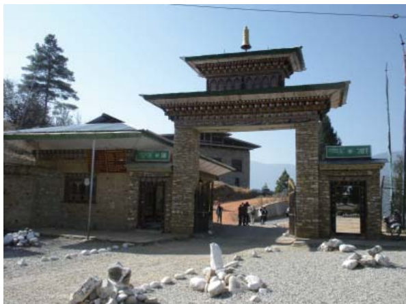
Photo 3-5-1 Main gate of the national museum.