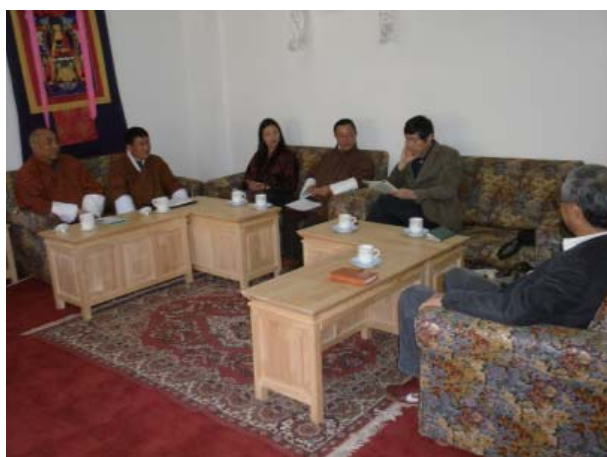
Interview with the director of the national library and public records building and the curator of the folk heritage museum.