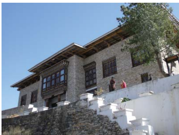
Photo 3-5-4 new building exterior.