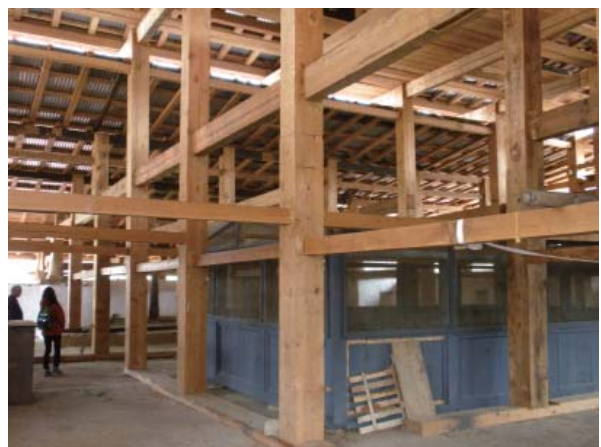
Photo 2-2-6 Reconstructed roof structure on top of Utse.