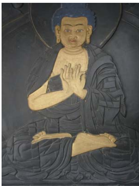
Photo 2-2-5 Sculptured stone slab at the base of Utse.