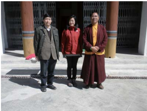
In front of the new museum building after the interview with the director of the national museum.