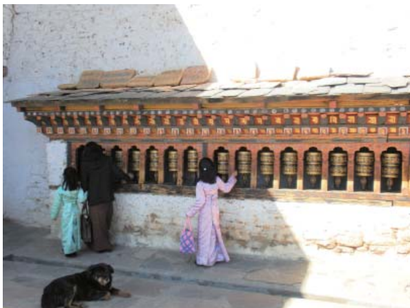
Photo 1-3-3 Prayer wheel on main hall outside wall.