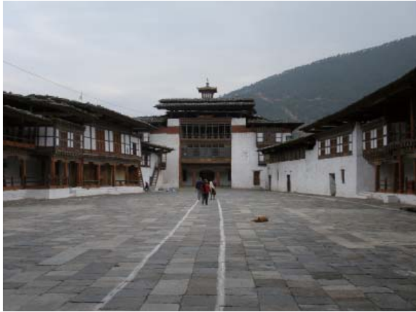
Photo 2-4-2 First courtyard.