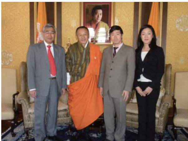
Courtesy visit with the Prime Minister.