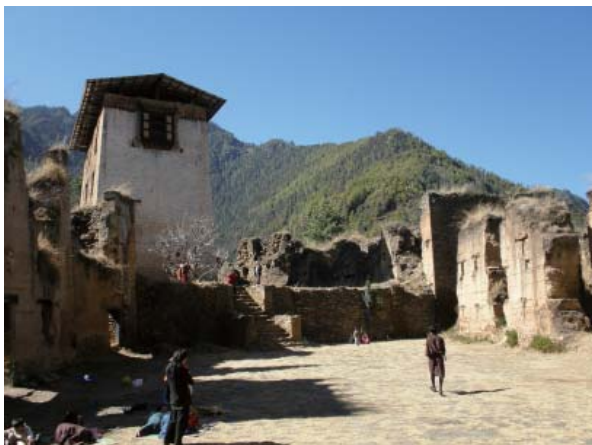
Photo 2-1-5 View of Utse from within the second courtyard.