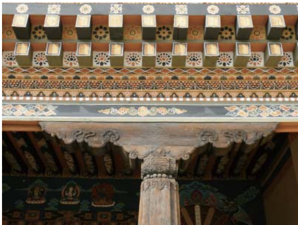
Photo 2-2-3 An original member on top of pillar.