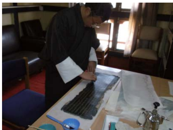
Photo 3-2-5 Conservation work to the scriptures.