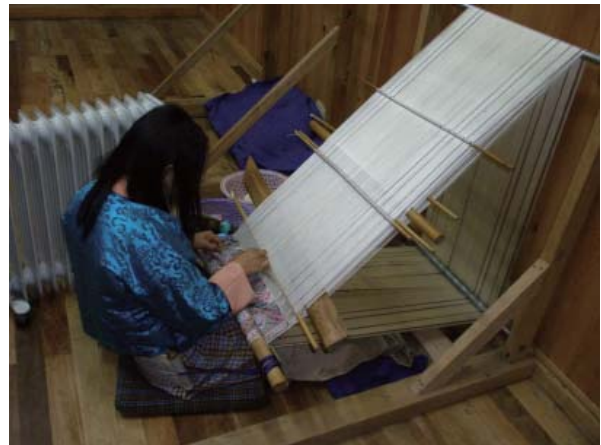
Photo 3-3-6 A weaver using triangular loom.