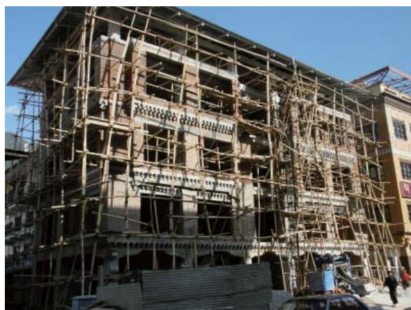
Photo 3-1-4 A building under construction.