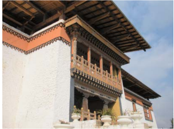
Photo 2-2-2 Restored east gate.