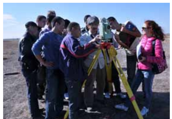
Training in the archaeological survey

The Kyrgyz Republic was selected as the host country of the project, as the National Research Institute for Cultural Properties, Tokyo has previously established an academic relationship with the Institute of History and Cultural Heritage in the National Academy of Science of the Kyrgyz Republic, and the relationship facilitated the planning and implementation of the project.