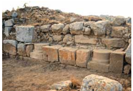
Gate at Burj Beitin