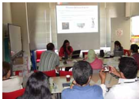
Presentation of Specialty Report and discussion (National Museum of Ethnology, fiscal 2013)

As a new international network initiative, National Museum of Ethnology is implementing a project on “New Horizons in Asian Museums and Museology” (funded by the Japan Society for Promotion of Science (JSPS); Core-to-core Program B: Asia Africa Science Platform) under a three-year plan from fiscal 2012. The project pursues educational research on museology in Thailand, Myanmar and Mongolia with the cooperation of past participants and experts who play a central role in museum activities in their countries. It aims to create new museology and museum research befitting Asia's cultural and social background and establish a foundation for voluntary and sustainable museum activities and human resource development in these countries. A joint workshop and public seminar have been held in Mongolia in fiscal 2012 and in Myanmar in September 2013.