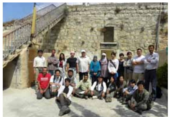
Excavation members lined up in front of an old building in the center of the village