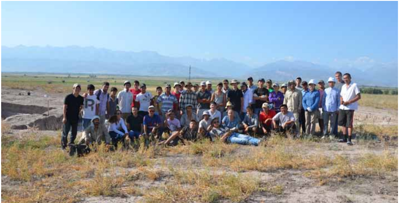
Excavation training at Ak-Beshim