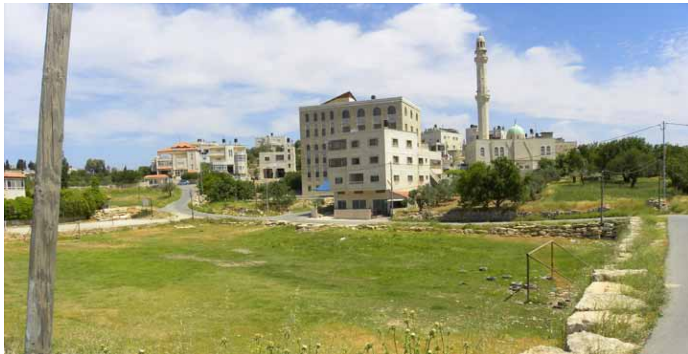
Main area of Beitin (view of the tell from a Byzantine-period reservoir)