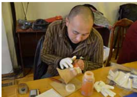
Training in the reconstruction of pottery