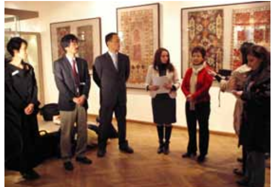
Opening ceremony held in the ethnic costume exhibition room