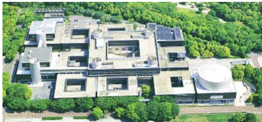
National Museum of Ethnology

JICA group and region-focused “Comprehensive Museology”