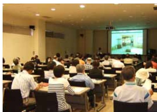
Public Forum “Museums in the World 2013” (National Museum of Ethnology, 25 May 2013)