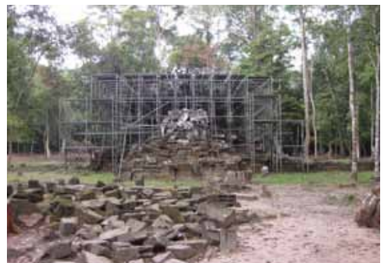
Temporary supports and the Southern Sanctuary before dismantlement