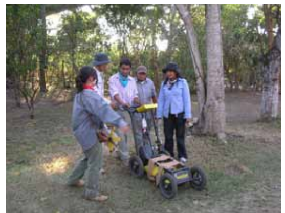
Salvadoran and Japanese students performing an underground radar probe in El Trapiche