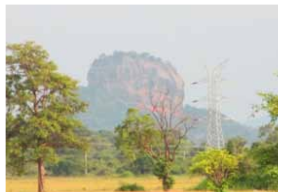
Ancient city of Sigiriya, the world heritage site