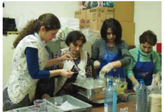
Training in dyeing