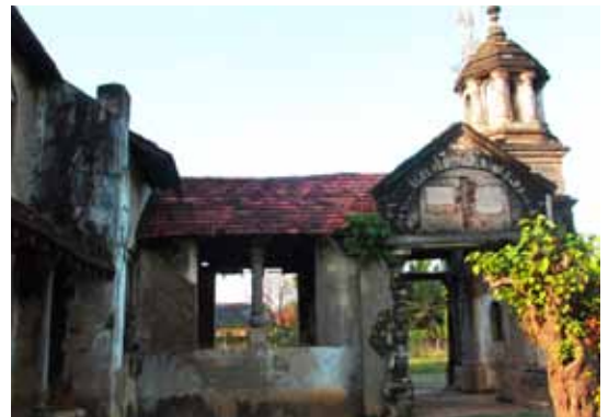
Deserted historical building in Jaffna