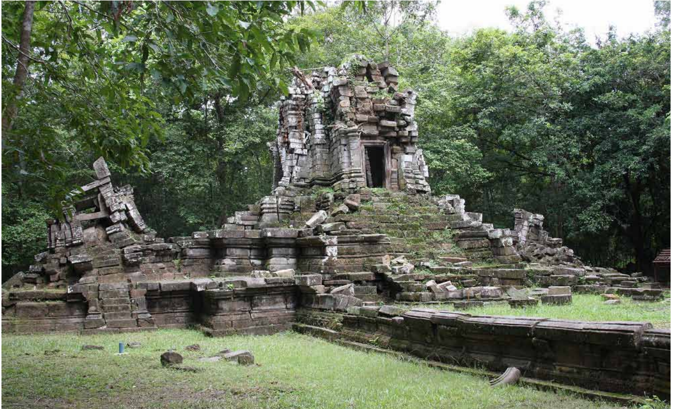
Full view of the Western Prasat Top Site