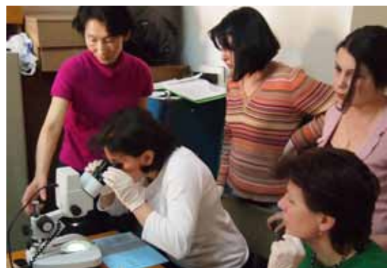
Study of a fabric using a microscope