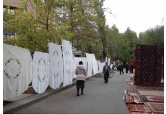
Embroidery and carpet market

(Mie ISHII, Japan Center for International Cooperation in Conservation, National Research Institute for Cultural Properties, Tokyo)