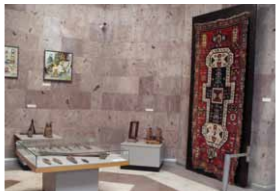
Carpet exhibition room in the National Museum of Armenian Ethnography and History of Liberal Struggle