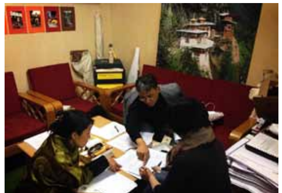
Meeting for the cultural heritage law drafting at the Ministry of Home and Cultural Affairs