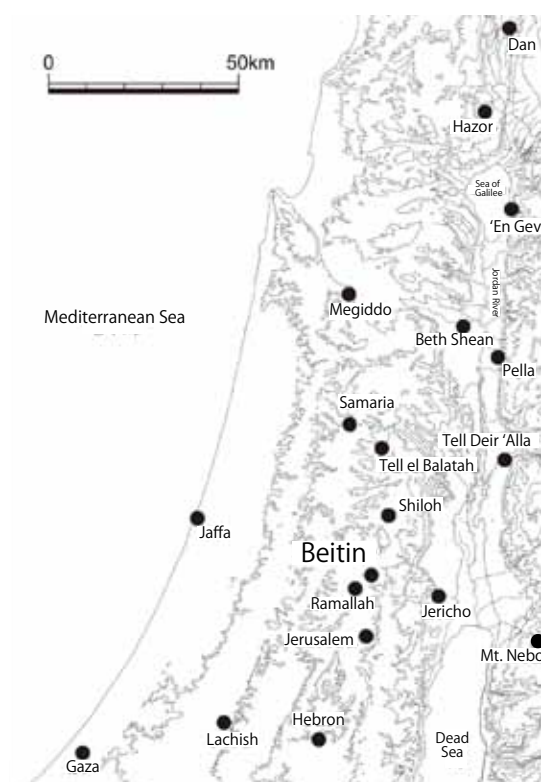
Location of Beitin

The site of Beitin, particularly that of the Bronze and Iron Ages, has been identified with the city of Bethel, which appears frequently in the Hebrew Bible, and is thus an invaluable site in understanding the faith and world of the Bible. It is a place where Patriarchs Abraham and Jacob, the forefathers of Judaism, Christianity and Islam stayed and particularly identified with the place where Jacob dreamt of angels coming up and down a ladder. When the United Monarchy separated into north and south, a national temple of the northern kingdom was built at Beitin and a “golden calf” is said to have been placed there to stand against the Temple of Jerusalem in the southern kingdom. Thereafter, written records show that people who returned from Babylonian captivity formed a community at Beitin (Bethel), and the area prospered as a pilgrimage site during the Byzantine period. Today, as more than half of the world’s population are believers of these religions, Beitin is expected to become a place of interest to many people and attract tourists from around the world.