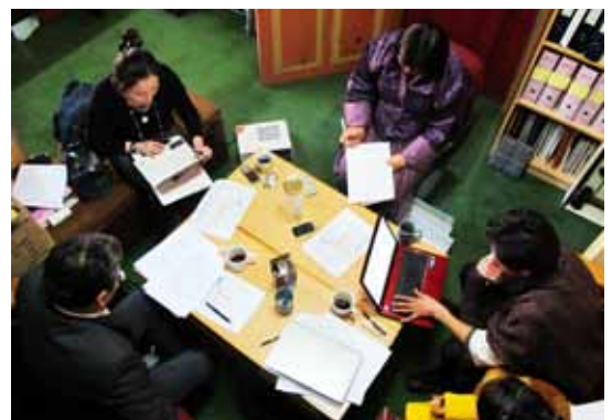
Drafting of the law