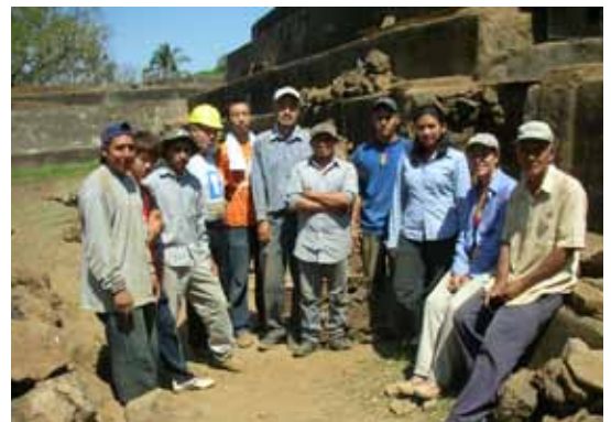
Salvadoran and Japanese students who participated in the archaeological survey at Tazumal

When we visited El Salvador for the first time in the 1990s on a survey tour, there were no archaeologists who graduated from a university in El Salvador, largely because no universities in the country offered a major in archaeology, and students who wished to study archaeology went to a foreign university. Given this situation, a major in archaeology was offered for the first time in the country at Universidad de San Jorge. In 1997, it undertook the role of providing practical training in archaeology and other relevant courses in an archaeological survey that was implemented by Kyoto University of Foreign Studies with funding from the Grant-in-aid for Scientific Research. Later, however, the five archaeology majors at Universidad de San Jorge transferred to Universidad Tecnológica de El Salvador (UTEC).