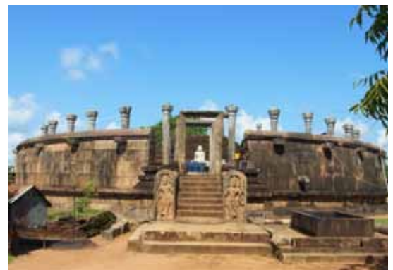
Archaeological site in Thiriyai

The civil war also took a drastic toll on tourism, which is Sri Lanka's principal industry. Thus, from the perspective of economic cooperation, Japan has also been economically supporting the promotion of tourism centered on the development of a museum at the World Heritage Site of the Ancient City of Sigiriya. However, as the security situation in the northern part of the country has remained volatile even with the end of the war, the area was inaccessible until recently.