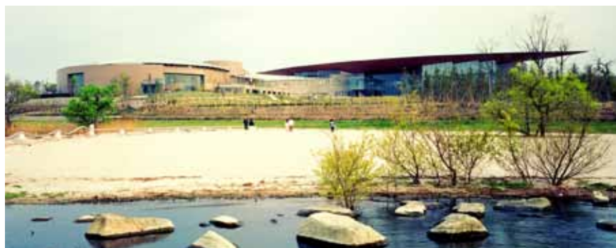
Lake Biwa Museum (Shiga prefecture)