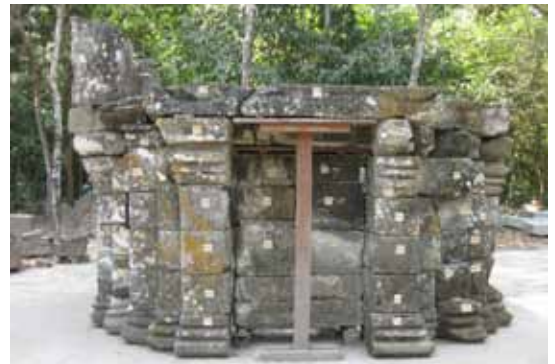
Dismantlement and restoration of the Western Prasat Top Site 2