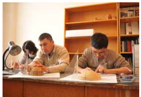
Training in drawing of excavated artifacts (pottery)