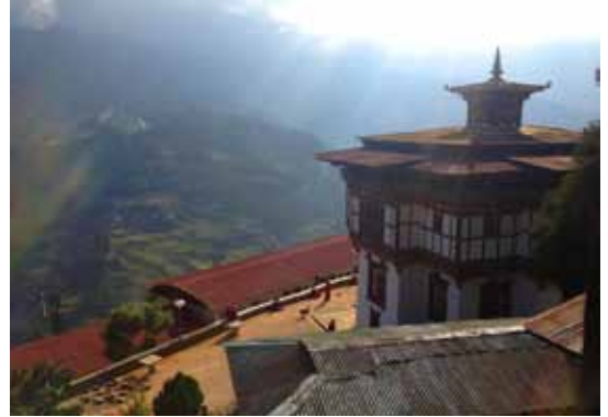
Landscape from the Dzong