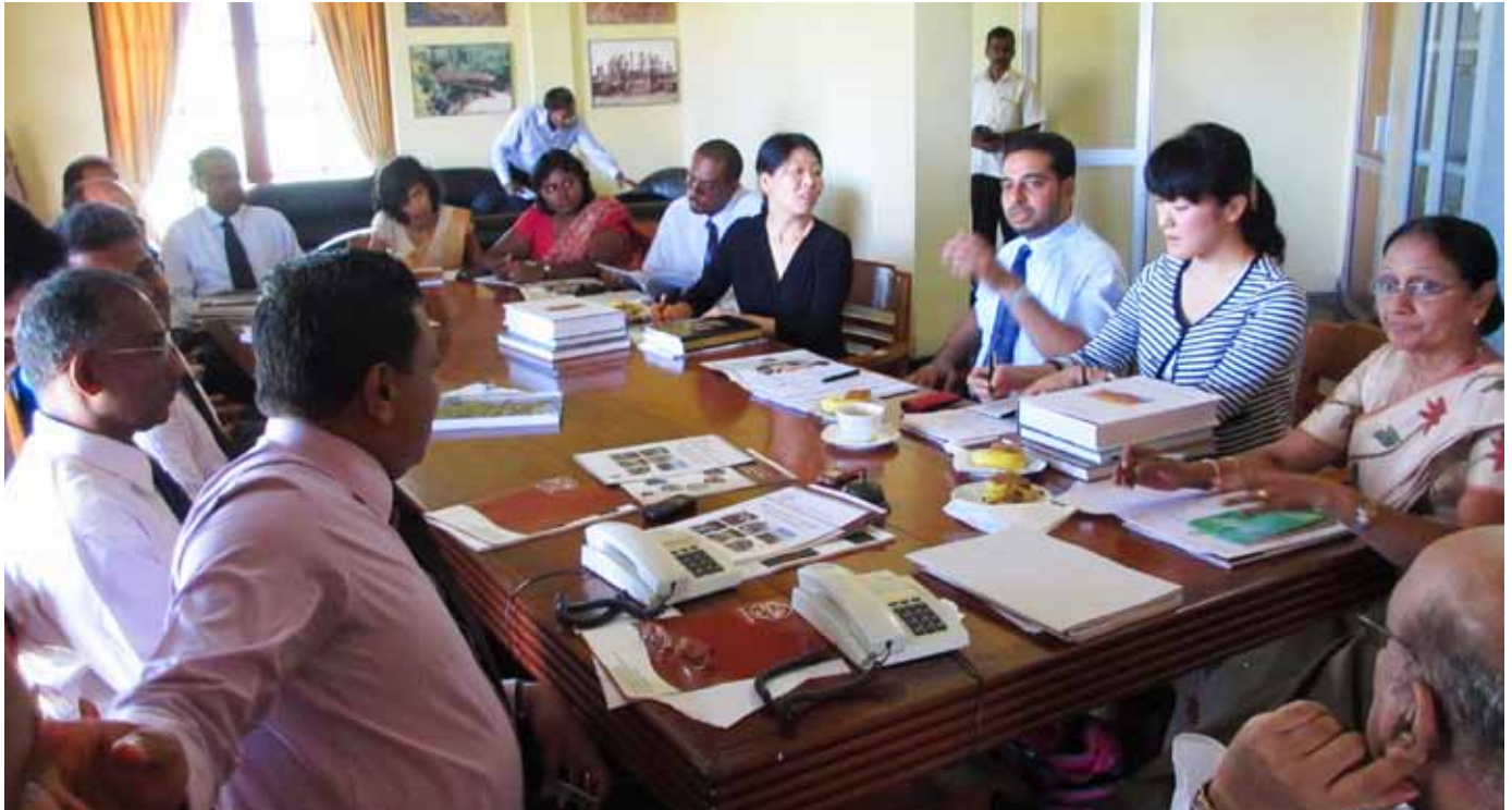
Meeting at Ministry of National Heritage in Sri Lanka