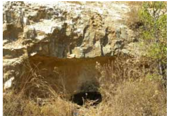
Examples of rock cut tombs scattered throughout Wadi Tawaheen