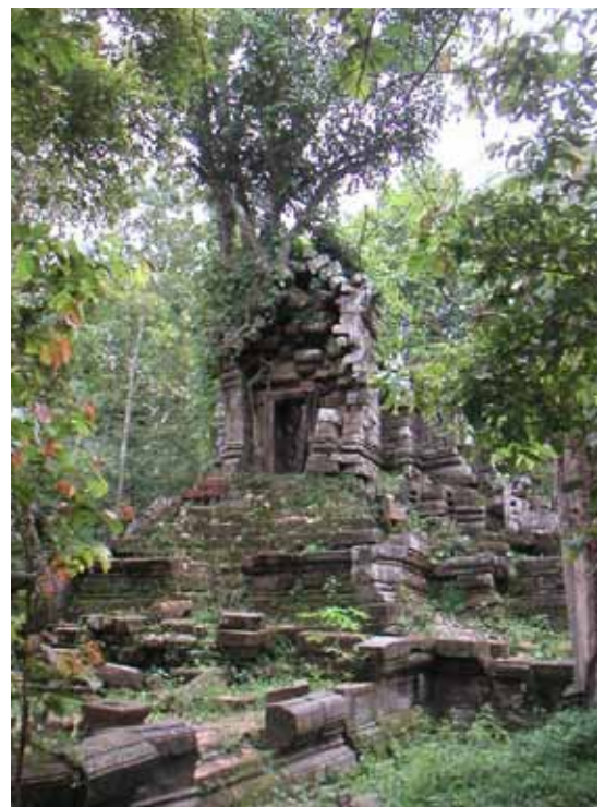
Condition before the survey of the Western Prasat Top Site

Overview of the monument: The Angkor monuments are situated in the northwestern part of Cambodia, and are mostly famous for the Angkor Wat and Angkor Thom, which occupy the center of the entire site. The project initially began as a survey of Banteay Kdei, but expanded to include the survey and conservation of the Tani Kilns and eventually the Western Prasat Top Site inside Angkor Thom in 2001. An inscription dating from the end of the 9th century was discovered at Western Prasat Top, but detailed surveys indicate that the site took on its present appearance during the 14th to 15th centuries. In the third medium-term plan, which was launched in 2011, dismantlement and restoration of the southern sanctuary was begun, and the lower base is now being dismantled.