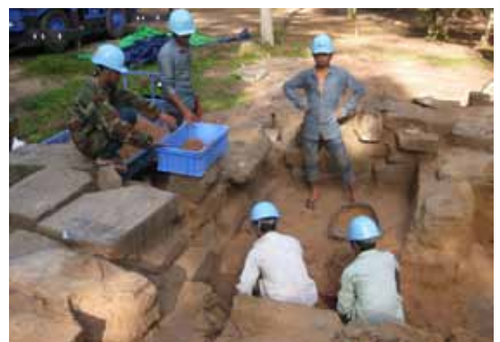
Excavation of the Southern Sanctuary