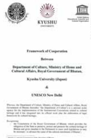
Memorandum of understanding exchanged between the Ministry of Home and Cultural Affairs of Bhutan and UNESCO

This dynamism ensures the continued existence of Bhutan's cultural heritage in the hands of its people, but it also signifies that any changes in traditional lifestyles will directly lead to modifications of the country's tangible heritage (such as rebuilding and renovation of the architectures). Ancient buildings have been continuously altered in response to needs for more space to accommodate an increasing number of monks and followers and for upgrading their functions, and have also increased their magnificence as a display of merit or other religious reason at every opportunity. However, given today's rapid trend toward modernization, relevant authorities in Bhutan face a large issue on how best to reconsider this cultural dynamism, which has heretofore been backed by traditional spirituality, within the administrative scope of cultural heritage protection. Thus the development of a legal framework for cultural heritage is strongly sought as an effective tool for the comprehensive protection of cultural heritage in Bhutan.