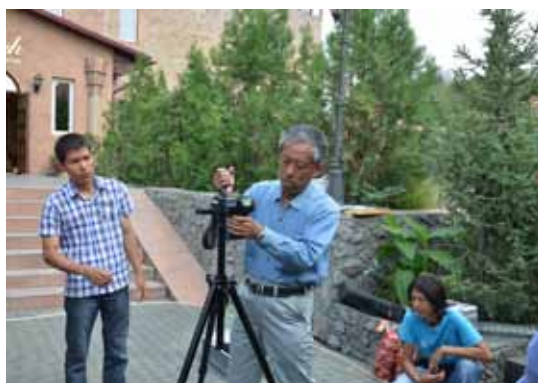
Training in the photo shooting of excavated artifacts