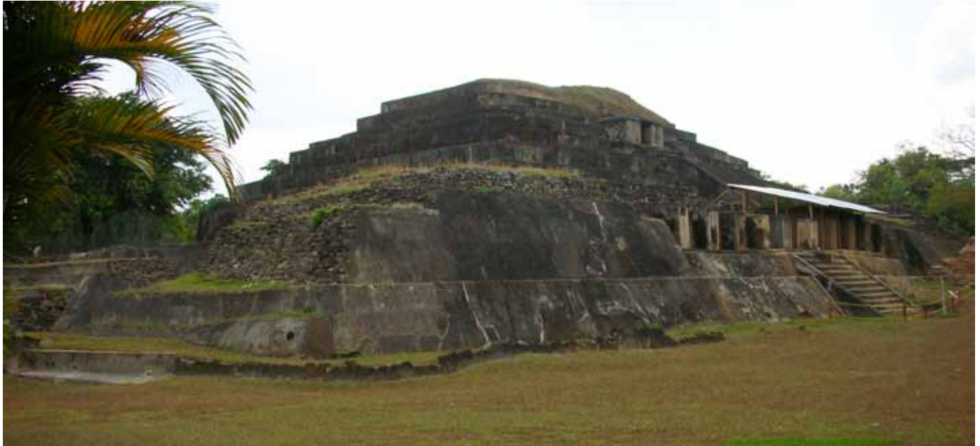
A pyramid at Tazumal archaeological park