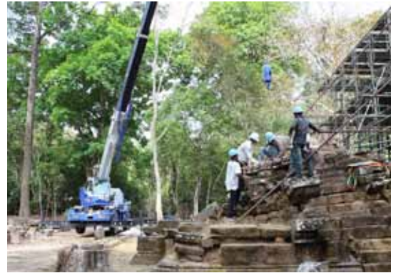
Dismantlement and restoration of the Western Prasat Top Site 1

(Hiroshi SUGIYAMA, Nara National Research Institute for Cultural Properties)