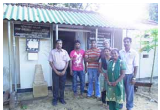
Staffs at Jaffna Museum