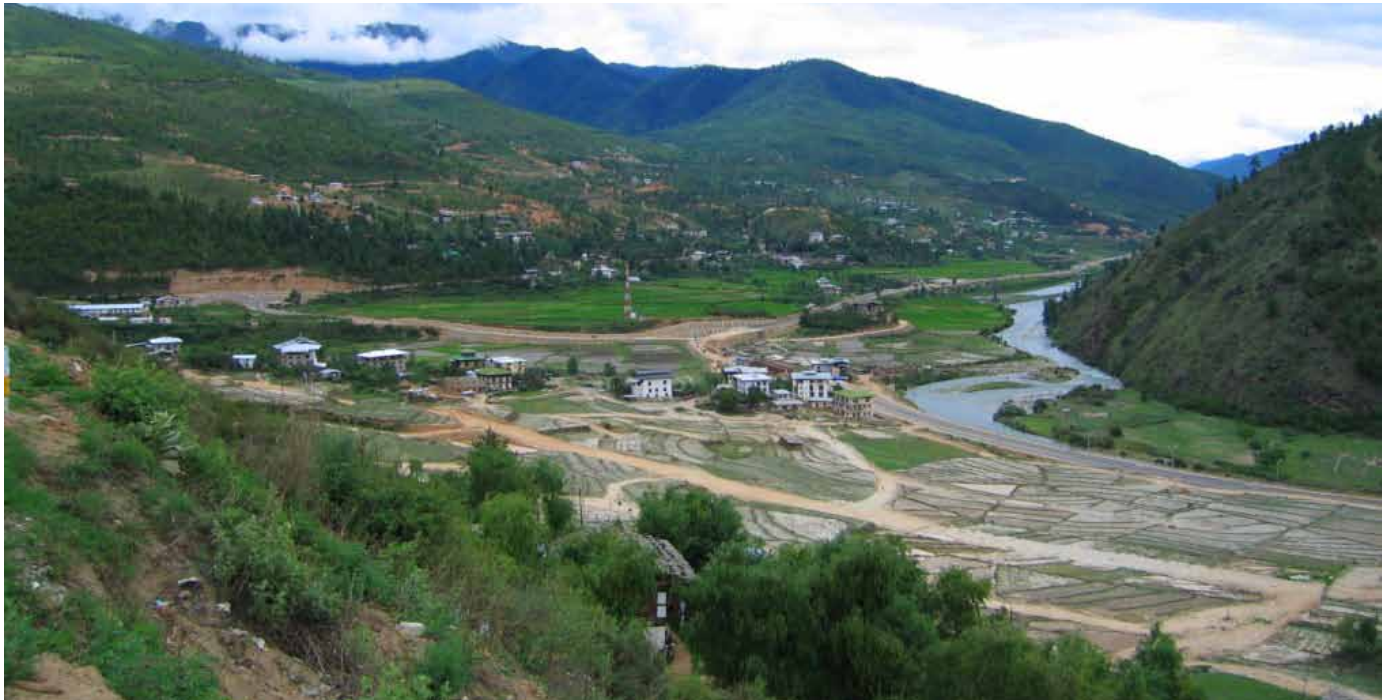
Scenery in Bhutan