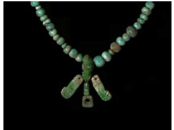
A turquoise and jade necklace found in burial 0 (estimated restoration)