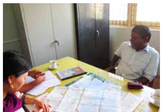
Meeting at University of Jaffna