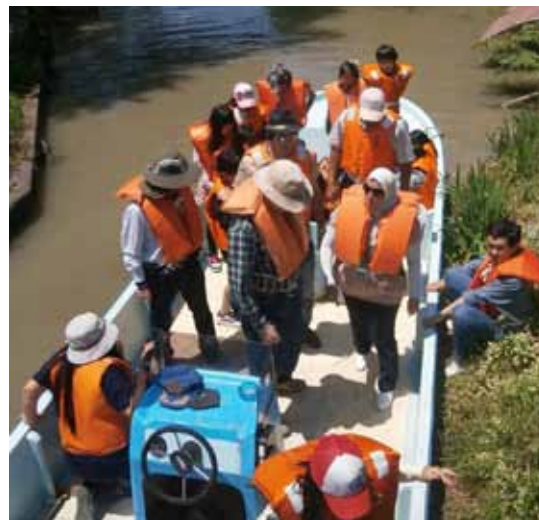
Practical module of the General Program (Lake Biwa Museum, fiscal 2013)

The course consists of a General Program (approx. 10 weeks) composed of lectures, practical training and study tour related to museum activities as a whole, and a Specialized Program (3 weeks) in which a different theme is selected every week. Selected themes for fiscal 2013 were “Preventive preservation,” “Exhibition design,” and “photography” for the first week, “Conservation and restoration of the objects,” “Museums and local communities,” and “Filming” for the second week, and “Excavating and controlling archaeological resources,” “Management of a local history museum,” and “Documentation and databases” for the third week. Participants have an opportunity to give a presentation on museum situations in their own country (Museum Report, Public Forum) or their areas of specialty (Specialty Report), and are expected to engage in mutual interaction through discussions.