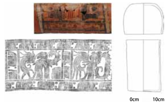
Offerings found on the southern side of a pyramid