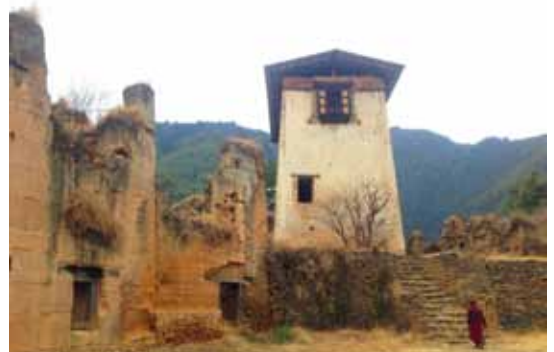
Ruined Dzong near Paro City