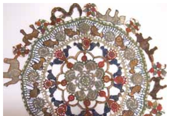
Noah's Ark produced by janyak(needle lace)