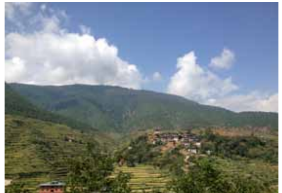
Traditional view of Bhutan