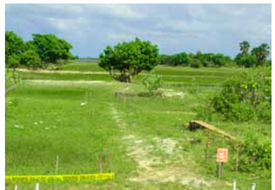
Ongoing clearance of landmine on the way to the northern province