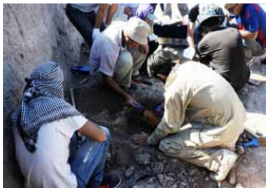
Training in the lifting of fragile artifacts