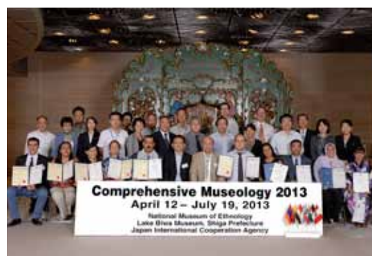
Participants of the fiscal 2013 JICA museology course

The National Museum of Ethnology, along with Lake Biwa Museum, plans, operates and supervises a museology course as a three-year project that began in fiscal 2012 under commission by Japan International Cooperation Agency (JICA). It is a course that provides practical skills specifically to manage museum operations. Compared to the predecessor course, “Intensive Course on Museology” (FY2004 – 2011), it is more strongly linked to tourism-related programs from multiple countries. Prior to these courses, a “Museum Management Technology (Collection, Conservation, Exhibition) Course” was offered from fiscal 1994 to 2003 mainly by the National Museum of Ethnology under the sponsorship of JICA, with the aim of developing leaders in museum management and operations who can contribute to promoting tourism and creating a foundation for education and culture from a broad perspective.