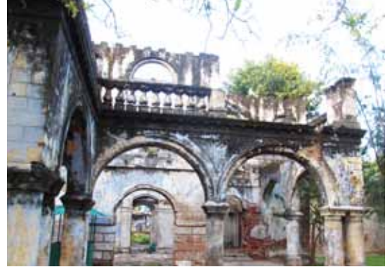
Jaffna old Kachcheri Building damaged due to conflict

(Tomomi HARAMOTO, Japan Consortium for International Cooperation in Cultural Heritage)