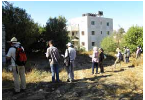
Scene of surface survey at Tell Beitin