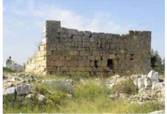
A tower at Burj Beitin