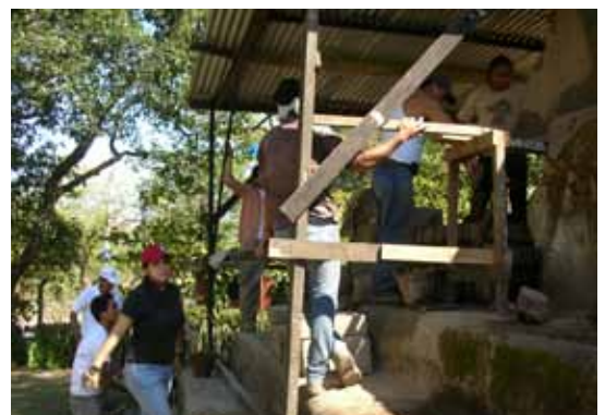
Researchers from the Department of Archaeology and students engaging in conservation and restoration activities in Tazumal archaeological park