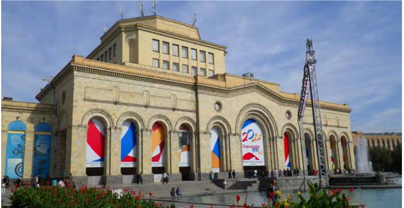
History Museum of Armenia